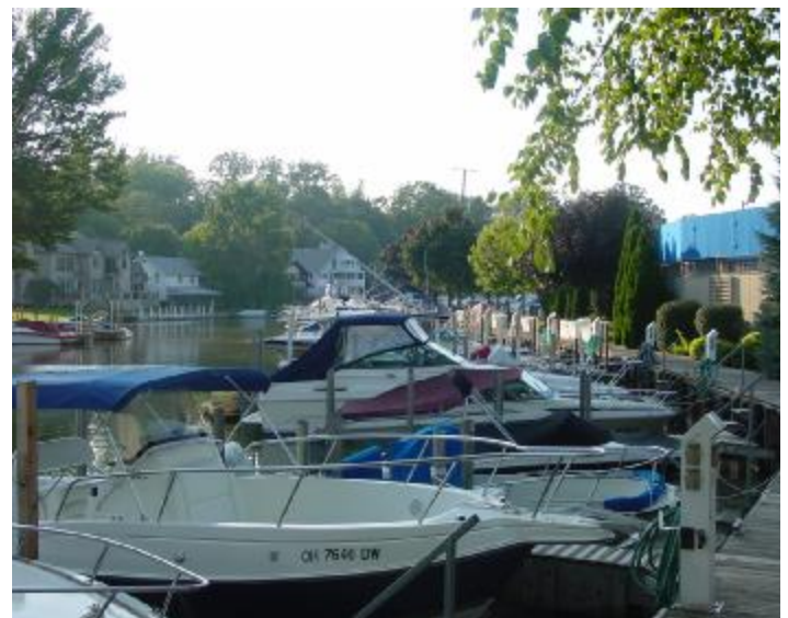
Everyone attending enjoyed the great food and company between both organizations ASPE / ASSE Clambake - September 9, 2009 - Cleveland Yachting Club -Rocky River, OH